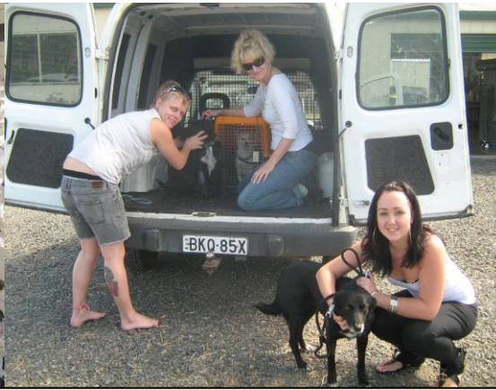
Volunteers arrive from the Casino pound 3 dogs and 2 cats last week save now