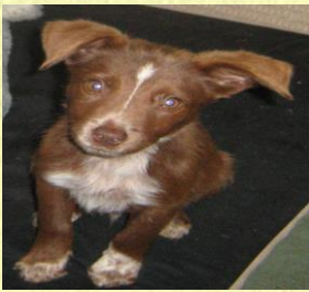
Rusty 1 of 3 kelpie x pups dumped in Lismore

Don't breed or buy while thousands of unwanted companion animals die in shelters & pounds annually.