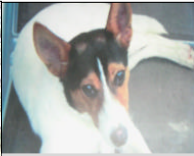
'Rosie' 1yr rescued from Kyogle pound