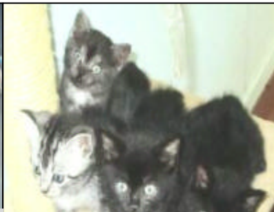
6 tiny kittens dumped in Alstonville