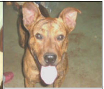
'Banjo' rescued from Casino pound