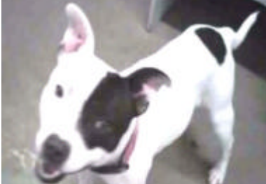
Patches 1yr staffie x Saved from the pound