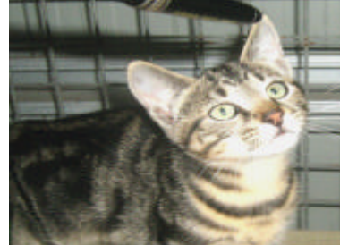
Tigger a manx kitten saved from the pound