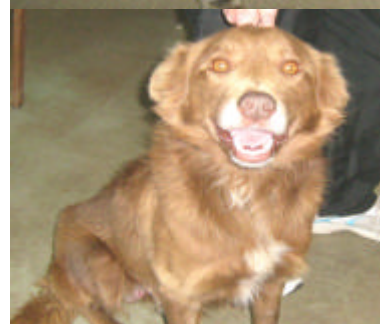
Ralph kelpie x saved from Casino pound