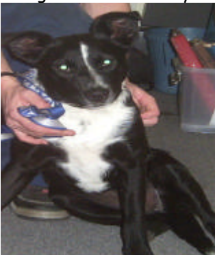
BINDY severely abused rescued by ARR she has now been adopted into a loving home.