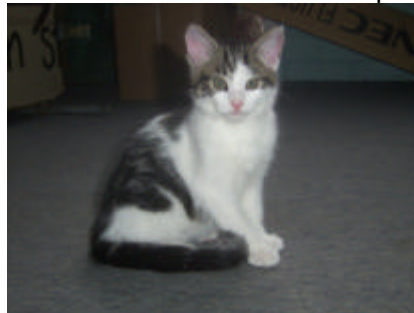
'Flash' was part of an unwanted litter rescued by ARR, very pretty and cuddly once settled with their foster carer. It was discovered Flash had a heart murmur and needed a special home. A wonderful lady and her daughter went to meet him and decided he was for them.