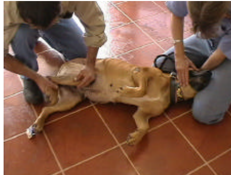
'Gidget' has suffered much abuse and her story was reported to us and we were able to rescue her. Covered in sores and scars and lame in the back leg. She is a staffie x Ridgeback approx 4years old. Her leg has been operated on and her progress is looking good. She has a great nature with people and children a one dog home preferred. WE ARE LOOKING FOR A LONG TERM CARER FOR GIDGET VIEW OUR WEBSITE FOR MORE ANIMAL RESCUE STORIES.