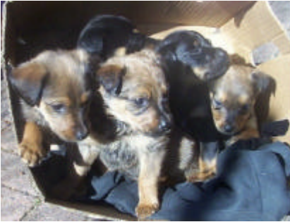
11 Staffie x puppies rescued and rehomed by ARR her third unwanted litter now ARR has desexed mum dog.