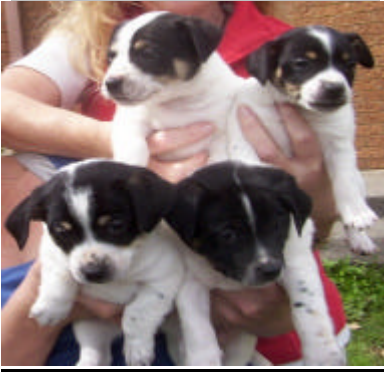
8 unwanted foxie pups rescued mum dog now desexed by ARR